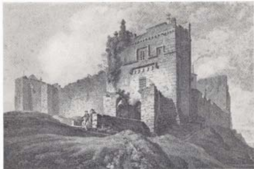
The Main Gate In 1778